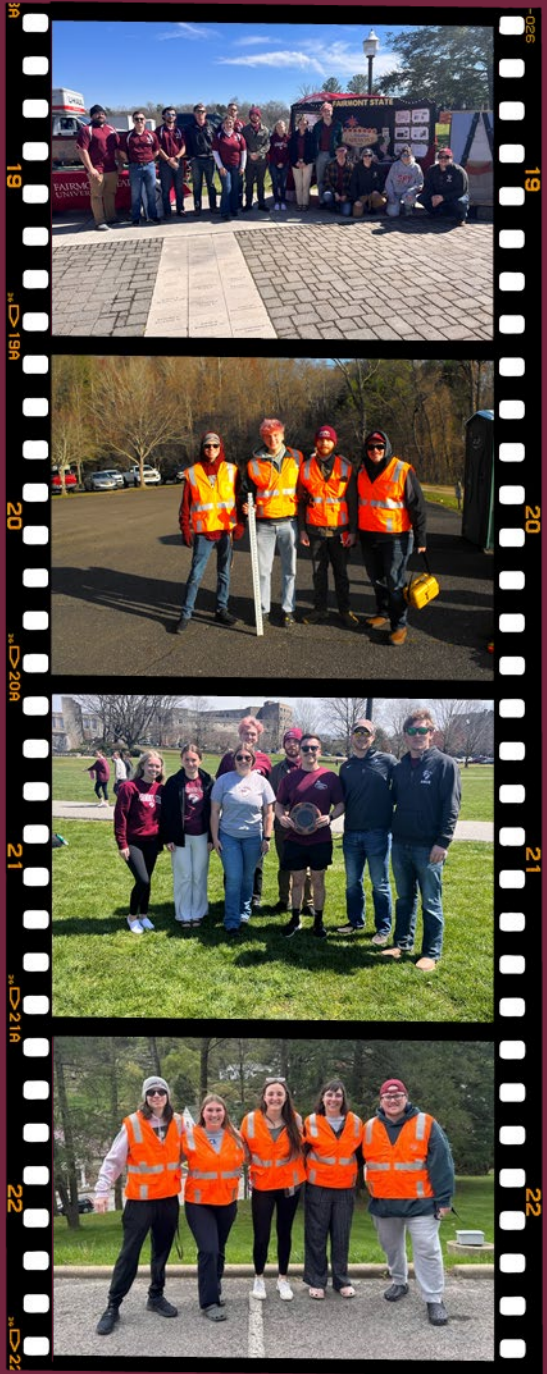
All proceeds benefit the ASCE and Falcon Surveyors Student Chapters